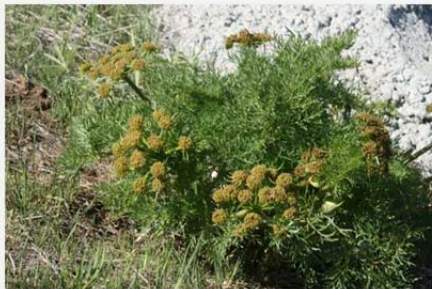
Sulphur-flowered buckwheat ( Eriogonum umbellatum )