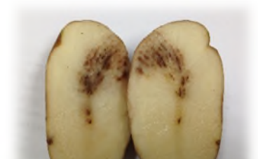
Potato mop top virus