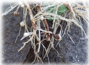
Rhizoctonia on potato roots

The presentations will focus on chemical management of diseases and will highlight research which has been funded by the Pacific Northwest Potato Research Consortium. ISDA pesticide recertification credits (2) and CCA Pest Management credits (2) have been requested for this meeting.