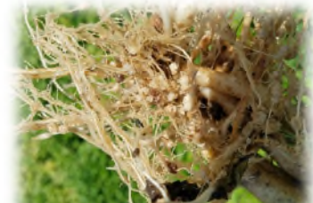
Powdery scab root galls