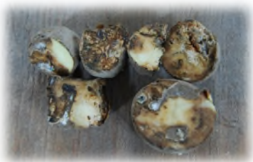
Fusarium dry rot