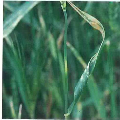
Fig. 6. Freeze ring on winter wheat stem shows junction of stem and leaf sheath collar at time of freeze.