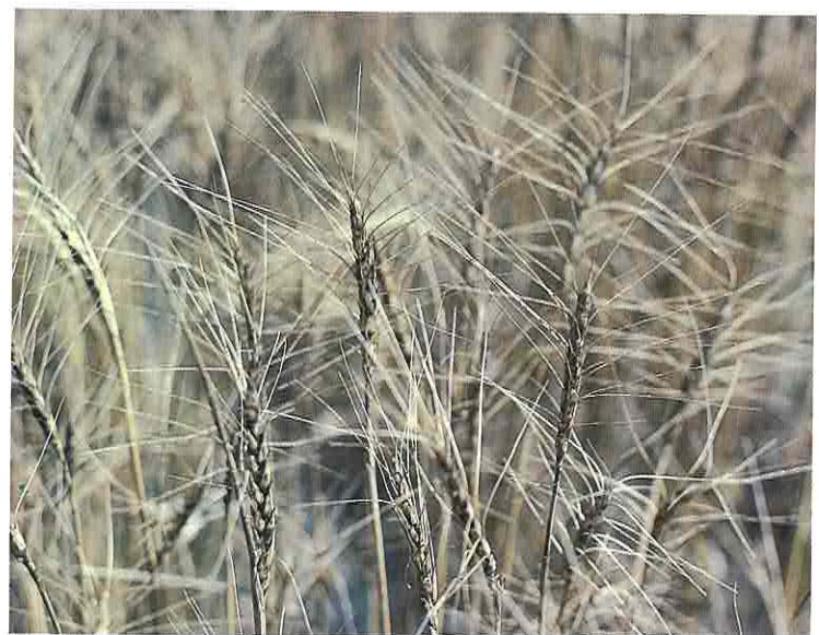
Fig. 7. Sterile wheat heads have awns bent at 90 degrees to the rachis.