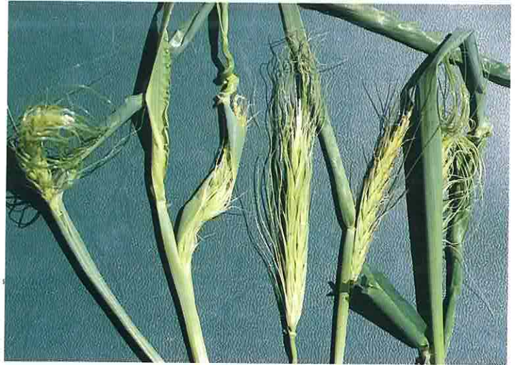
Fig. 5. Distorted heads of winter barley caused by spring-freeze-induced "trapping."