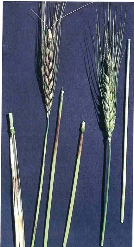
Fig. 4. Spring-freeze-damaged winter wheat stems showing discoloration below the nodes.