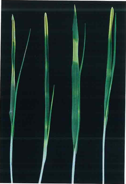
Fig. 3. Freeze bands on spring barley seedlings.