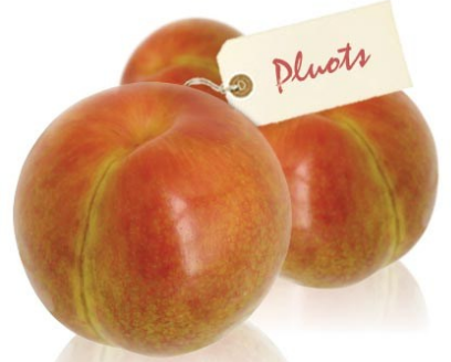
ID and OR Pesticide Credits Pending

Turning Point Technologies will be used to evaluate impact in each session.