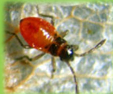
Immature elm seed bug