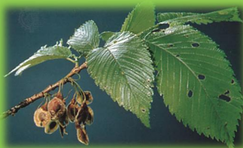
Elm leaves and seed