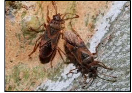
Adult elm seed bugs

In summer 2012, the elm seed bug (ESB) , an invasive insect new to the U.S., was detected in Ada and Canyon counties in Idaho in July 2012; it was later found in Elmore, Gem, Owyhee, Payette, and Washington counties and in Malheur County, Oregon. Commonly distributed in central-southern Europe, ESB feeds primarily on the seeds of elm trees, although they have also been collected from oak and linden trees in Europe. The insect does not damage trees or buildings, nor does it present any threat to human health. However, due to its habit of entering houses and other buildings in large numbers to escape the summer heat and later to overwinter, it is a significant nuisance to homeowners.