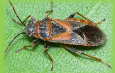
Adult elm seed bug