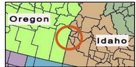
Circled area is where ESB was confirmed as of autumn 2012.