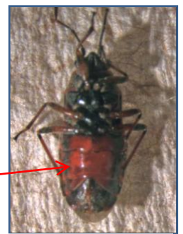
Red abdominal segments

Flip an adult ESB over to see its reddish-colored abdominal segments .